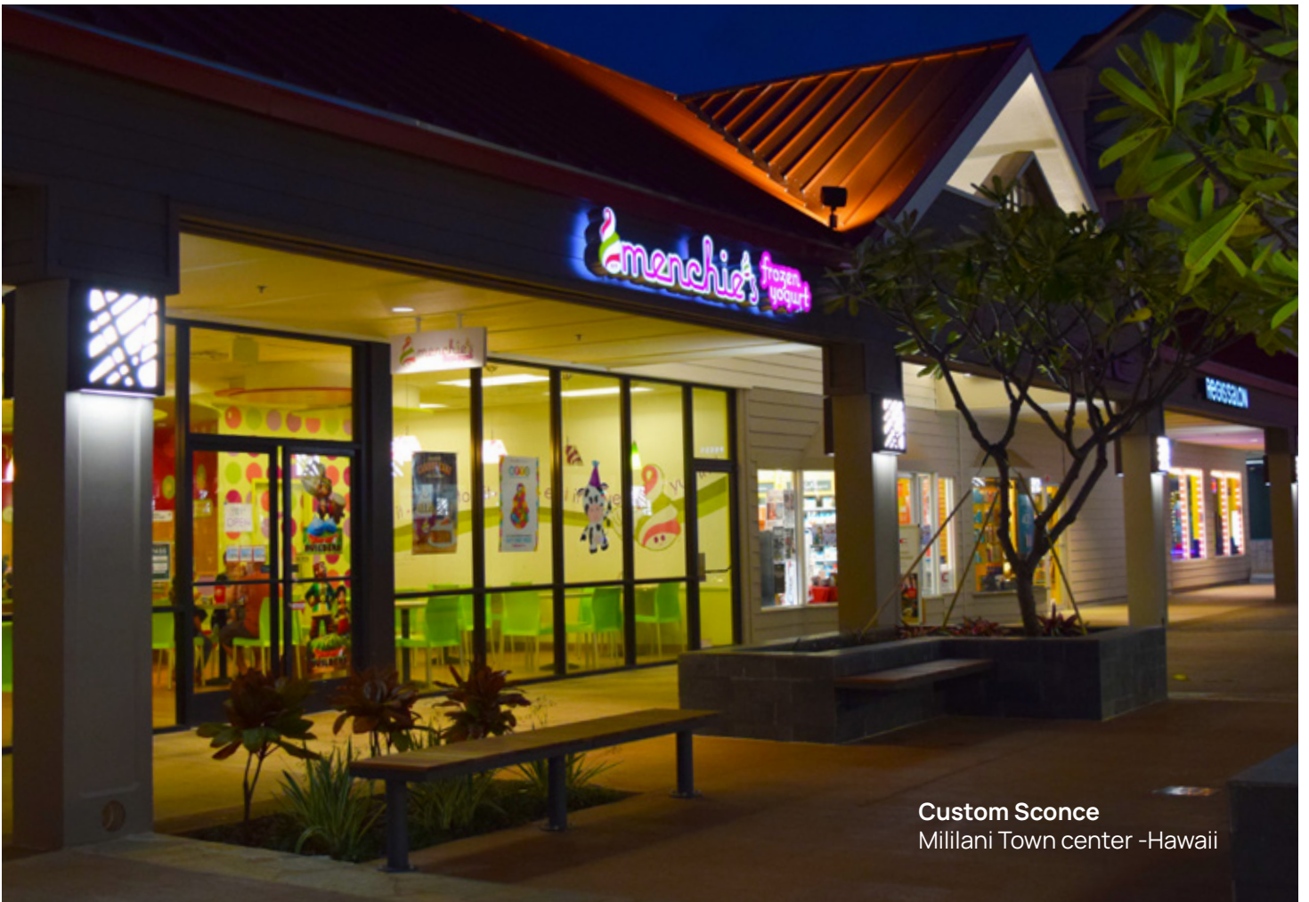
Custom Scence Mililani Town center -Hawaii