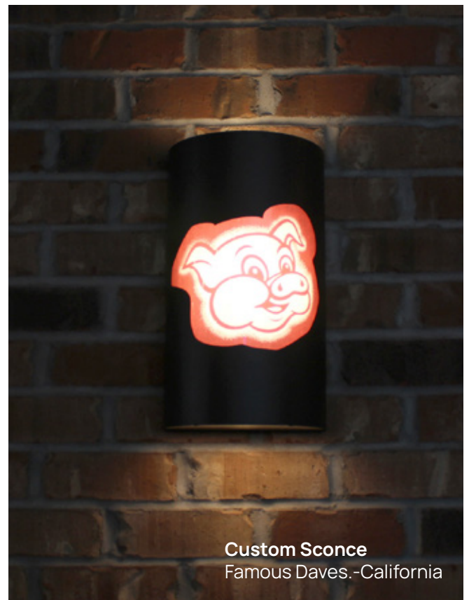
Custom Sconce Famous Daves.-California

Our specialized approach combines innovative design with cutting-edge technology, allowing you to imprint unique patterns, logos, or intricate designs onto high-quality 8mm vinyl.