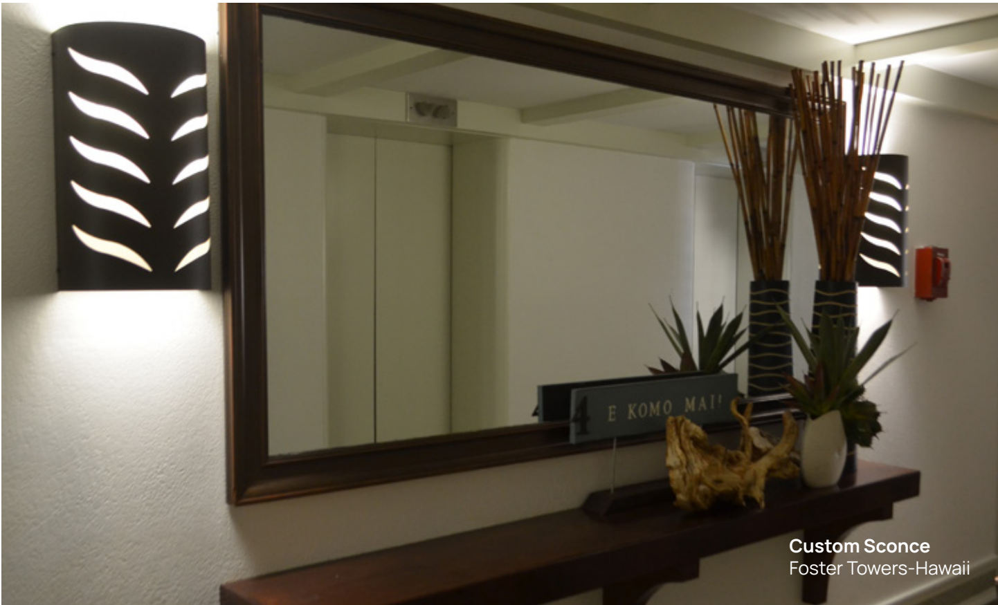
Custom Sconce Foster Towers-Hawaii