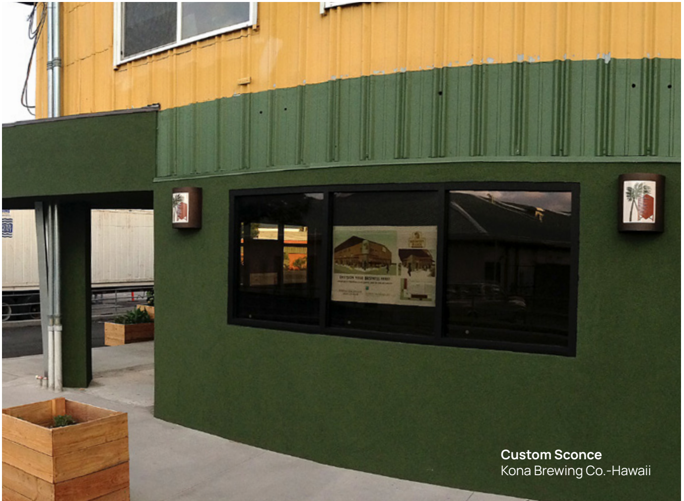
Custom Sconce Kona Brewing Co.-Hawaii