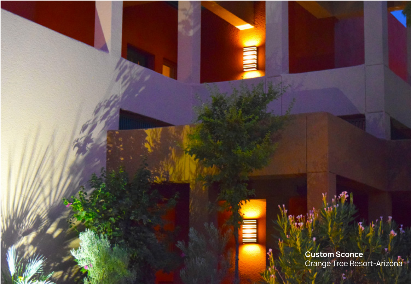
Custom Sconce Orange Tree Resort-Arizona