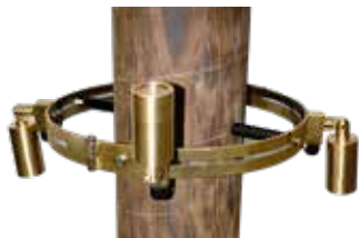
TREE RINGS FATR (FIXTURES NOT INCLUDED)