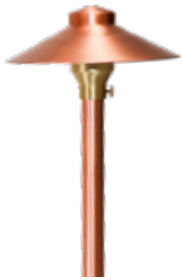
AREA LIGHTS AL/RXA