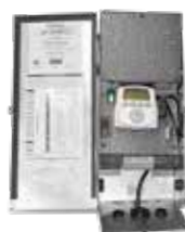
RXT TRANSFORMERS ALL WATTAGES TIMER READY (STANDARD)