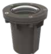
WELL LIGHTS SL20SM/MD