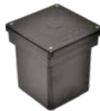
DIRECT BURIALS TRANSFORMERS / JBOXES