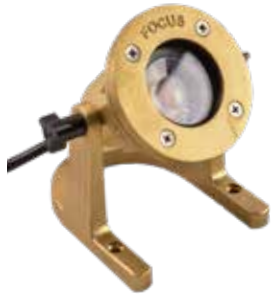
SL33ABL24 SL-33-LED w/ aiming bracket