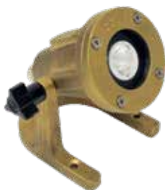
SL40ABL68 SL-40-LED w/ aiming bracket