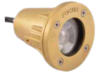
SL33L24 3w MR16 LED (36°) 40,000 hour Cast Brass Underwater Light w/15' cord