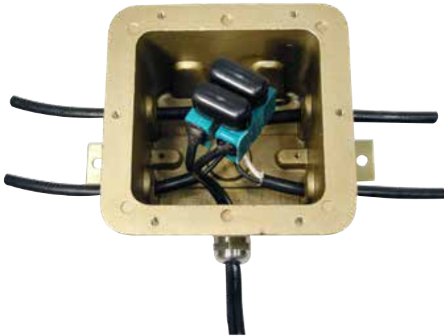
FAH20JB Underwater J-Box (w/25ft 12/2C feed wire) 5.50 Lbs

“The OCTOPUS” underwater J-Box is designed for connection of up to eight 12v 18/2 SJTOW cords for under water fixtures. Tap sizes available - PG9, PG11, 1/2”NPS & 3/4” NPS. For 1/2” or 3/4” service conduit contact FOCUS. For additional PG9 hole with plug, specify at time of order. NOTE: Brass liquid tight fittings recommended. Fitting size must match cable size to ensure water proof connection.