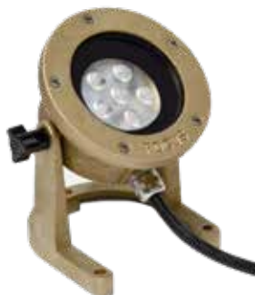
SL11ABLEDMBRS 7/11/15 or 20w LED Module Cast Brass Underwater Light w/ aiming bracket & 15' cord