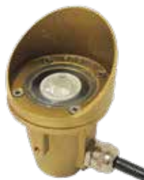
SL40ACSM68 SL-40-LED w/ side mount & angle collar