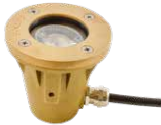
SL33SML24 SL-33LED w/ side mount