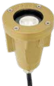
SL40L68 3w MR11 LED (40°) 40,000 hour Cast Brass Underwater Light w/15' cord