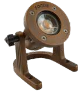
SL33SMACL24BAR SL-33-LED w/ side mount & angle collar