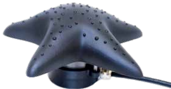
SL51STBAT 3w MR16 LED, 40,000 hour Cast Brass Underwater Light w/15' cord