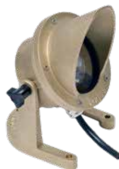
SL11ABACLEDMBRS 7/11/15 or 20w LED Module Cast Brass Underwater Light w/ aiming bracket, collar & 15' cord