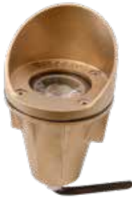
SL33ACL24 SL-33-LED w/ angle collar