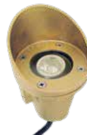
SL40ACL68 SL-40-LED w/ angle collar