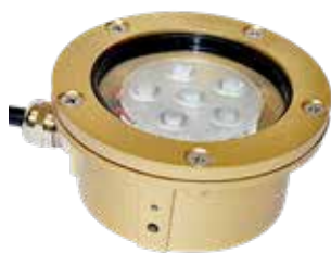
SL11LEDMBRS 7/11/15 or 20w LED Module Cast Brass Underwater Light; 15' cord