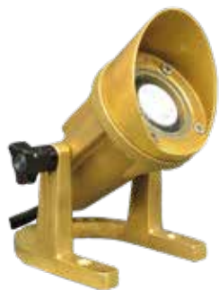
SL40ACABL68 SL-40-LED w/ aiming bracket & angle collar