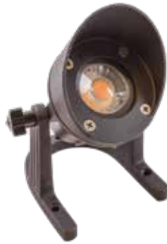
SL33ABACL24BAT SL-33-LED w/ aiming bracket & angle collar