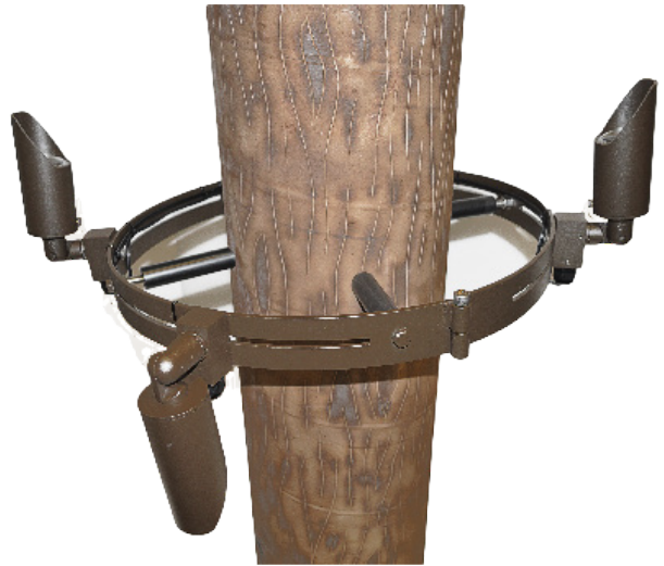
FA-TR-244HBRS w/ 4x DL50BRT

CONSTRUCTION: Aluminum or brass tree ring, 20" or 24" diameter.