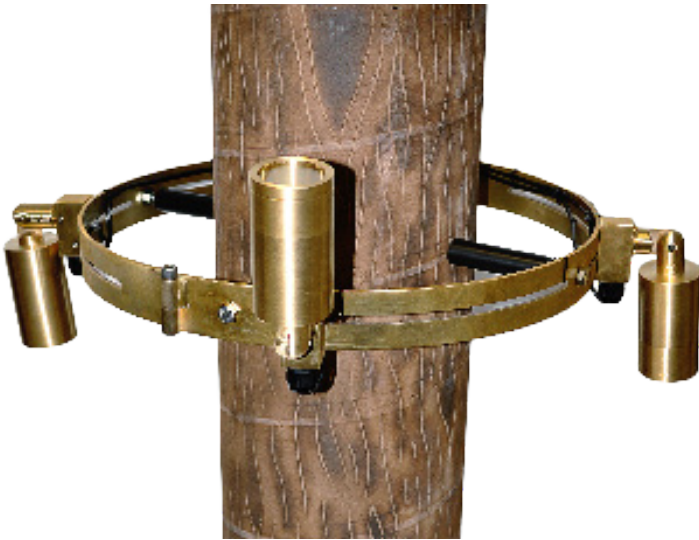
FA-TR-204HBRS w/ 4x RXD08LEDBRS