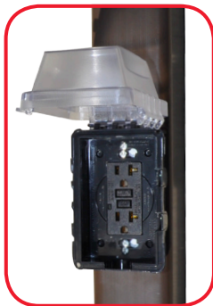
Detail of 120v GFI receptacle with weatherproof cover