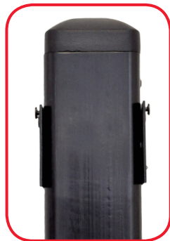
Detail of FA-26-TMS2-BLT with dual transformer mounting plates