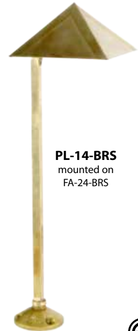
PL-14-BRS mounted on FA-24-BRS