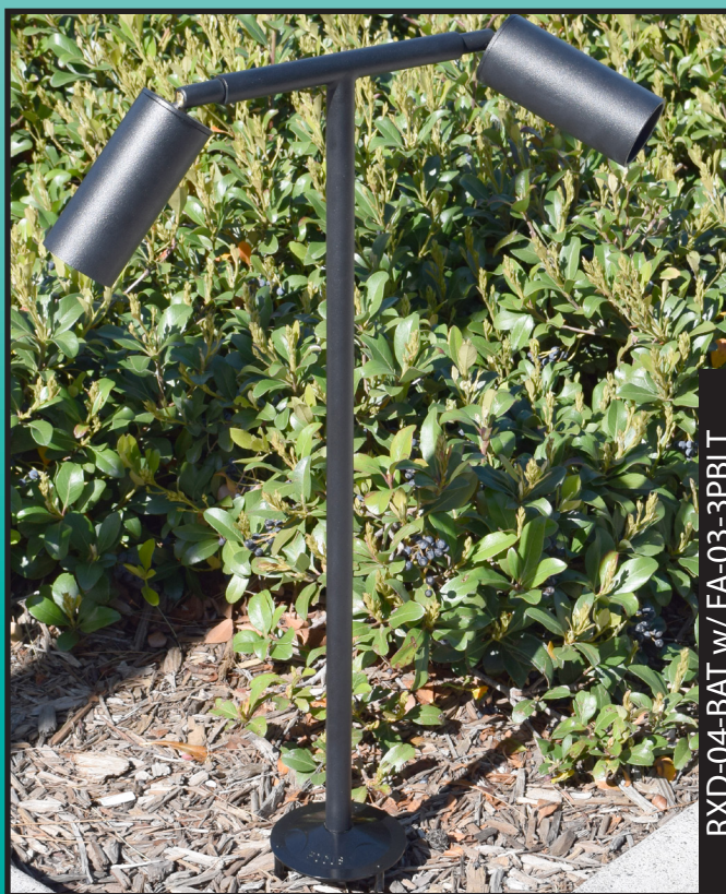
RXD-04-BAT w/ FA-03-3PBLT

25301 COMMERCENTRE DRIVE • LAKE FOREST, CA 92630 • 949.830.1350 • 888.882.1350 • FAX 949.830.3390