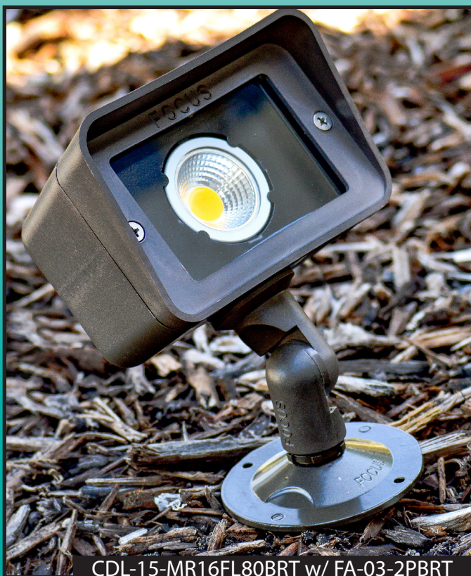
CDL-15-MR16FL80BRT w/ FA-03-2PBRT