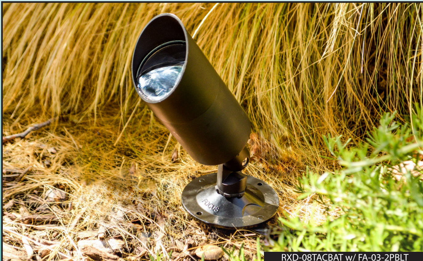
RXD-08TACBAT w/ FA-03-2PBLT