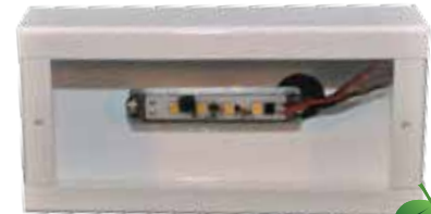
2w WATERPROOF LED STRIP