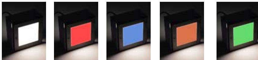
WHITE RED BLUE ORANGE GREEN