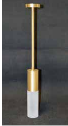
SL-16P-MR16-S16-BRS (6" snoot)

Extended Snoots Available In 6" & 12" Lengths