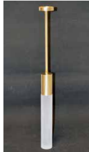
SL-16P-MR16-S112-BRS (12" snoot)