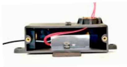
HW-12-60LED & CFA-111