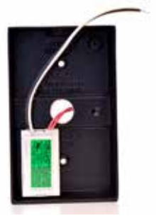
HW-12-60LED & FA-22