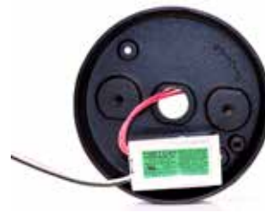
HW-12-60LED & FA-24LG-CST