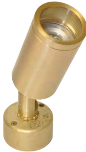
RXD-08-BRS w/ FA-24-MDCST-BRS