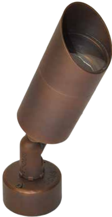
RXD-08-TACBAR w/ FA-24-MDCST-BAR