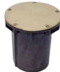
DB-12-75E-BRS DB-12-150E-BRS DB-12-LED10-BRS DB-12-LED60-BRS DBR-55-JB-BRS