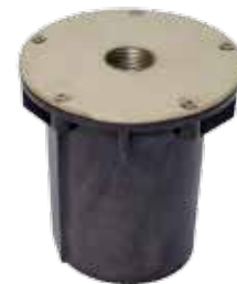
Shown with 1/2" NPS tap on cover