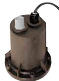
(2) 1/2" NPS threaded ports available on bottom