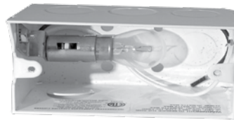
SL-02 / SL-02-AL / SL-02-3LC / SL-02-VERT Back Box