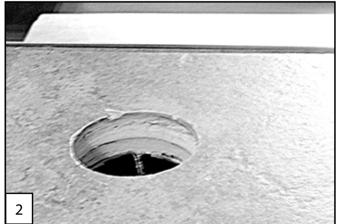
(2) Clean and dry hole prior to next step. Walls of hole should be free of dust, debris and moisture.

Note: Use a wood template to start core bit. A template will help the bit stay centered.