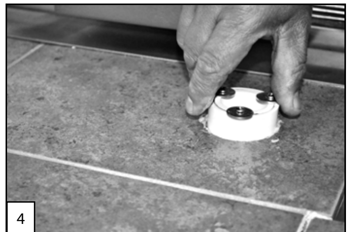
(4) Insert mounting sleeve into place. Rotate sleeve slightly to ensure even coverage of adhesive to sleeve. The washers will rest on the counter top holding the sleeve in place.

Note: Set a container under hole to catch excess adhesive.