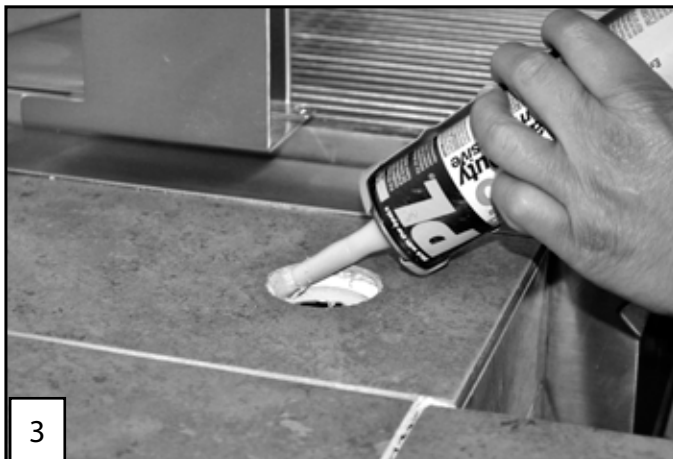
(3) Apply adhesive into hole. Make sure the adhesive is applied to the entire wall of the hole.

Note: Set a container under hole to catch excess adhesive.