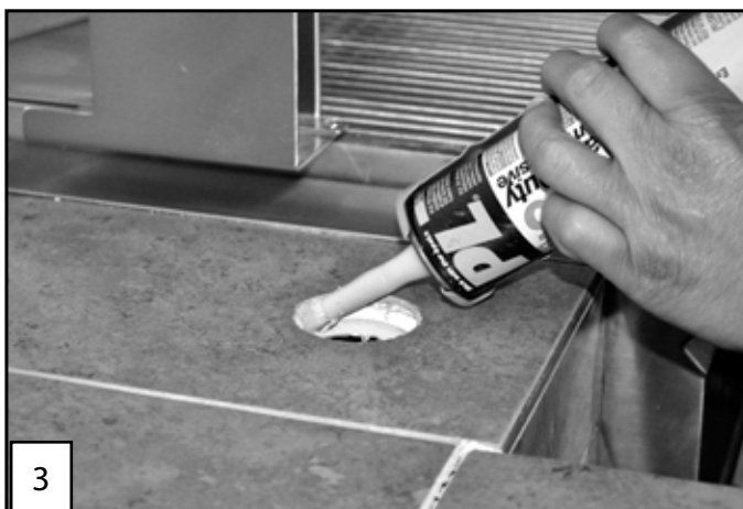
(3) Apply adhesive into hole. Make sure the adhesive is applied to the entire wall of the hole.

Note: Use a wood template to start core bit. A template will help the bit stay centered.