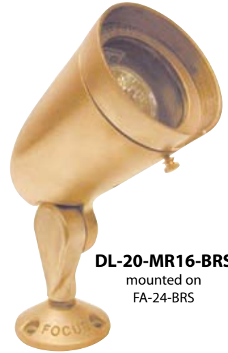
DL-20-MR16-BRS mounted on FA-24-BRS